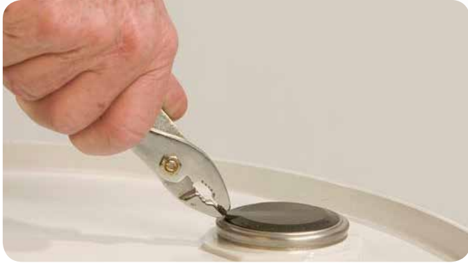
1. Grab the lifting tab with pliers.