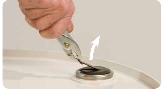
2. Pull up to break the tab loose.