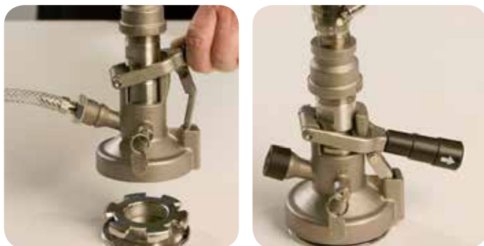
The MAV Coupler Mounting Bracket secures the coupler when not in use.

CAUTION: If threaded adaptor is used, discard the filter.