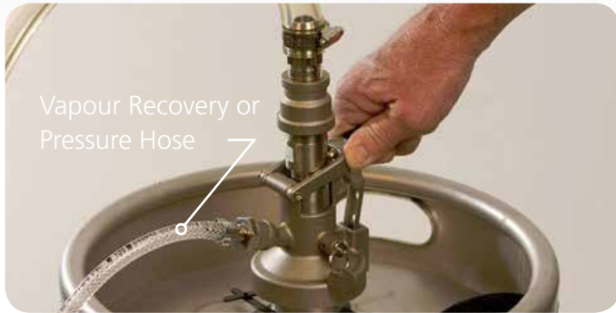
MAV Coupler with vapour recovery hose attached.