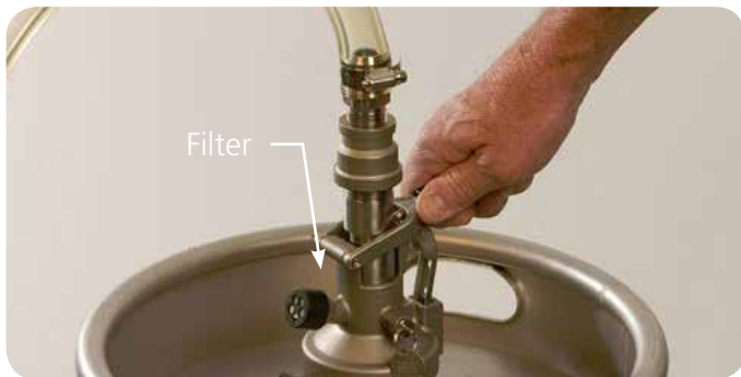
MAV Coupler with Filter attached.