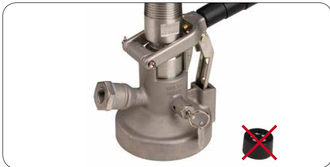
MAV Coupler with threaded adaptor attached.

CAUTION: If threaded adaptor is used, discard the filter.