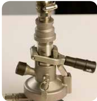
MAV Coupler and Rinsing Socket.