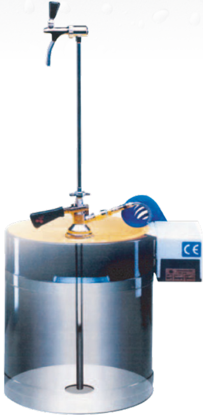
Dispense tap and compressor

The drums are customized with the company logos and product description. They are also equipped with a RFID chip for tracking and monitoring the distribution of the containers. The tracking data can be processed in the company to collect information about sales & marketing and product use and distribution.