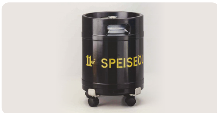
33L PU coated stainless steel container on trolley

Besides these operating advantages for customers, 11er's innovative returnable container system offers key benefits in terms of reducing the costs of waste packaging disposal and at the same time enabling greater efficiency, cleanliness and readiness in the hotel and catering services industry.